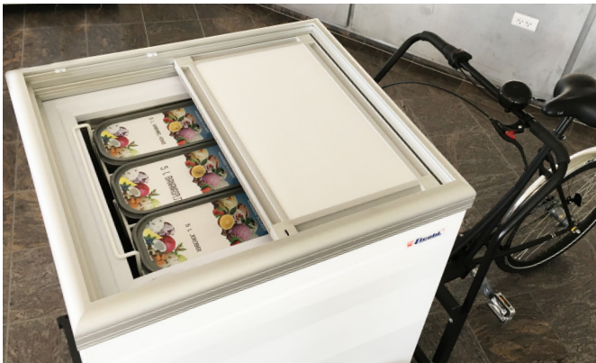
MOBILUX 11 FREEZER WITH SCOOP CONTAINER