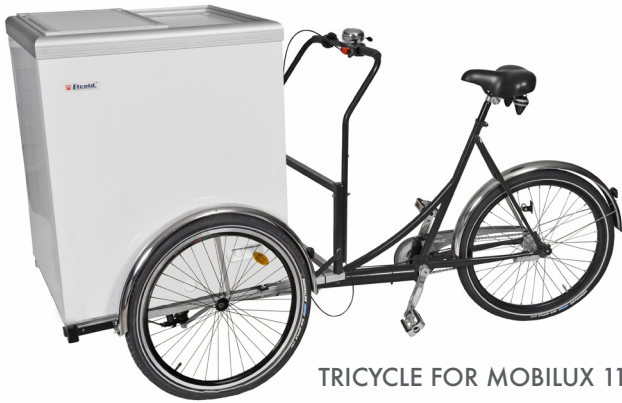
TRICYCLE FOR MOBILUX 11

Combi version of freezer and cooler. The Mobilux 12 V freezer or cooler is the right choice if you need mobility or don't have power available. It will help you to sell your ice cream, frozen foods or cold drinks in places, where this normally would not be possible as it can be supplied and installed on a tricycle. It works with an input of 230 volt/ 110 volt to a charger, which supplies a 12 volt gel battery. Once loaded, the battery will run a 12 volt compressor. The battery and compressor are both well hidden inside the motor compartment.