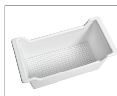
FOOD BUCKET (APPROVED FOR FOOD)