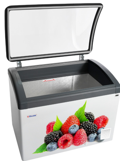
FOCUS 106 V WITH OPEN LID