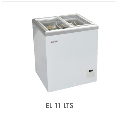
EL 11 LTS