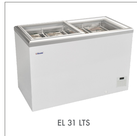
EL 31 LTS