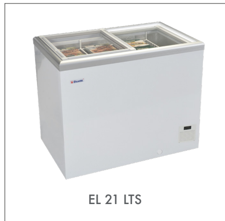
EL 21 LTS