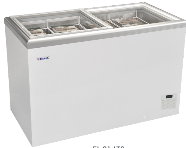
EL 31 LTS